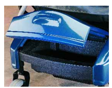
Trunk for storage of personal items.